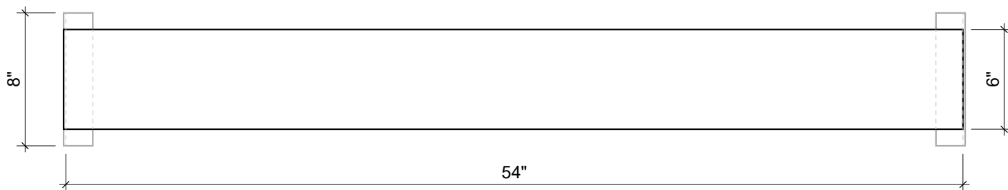
1 SIDE 1 1/2" = 1'-0"